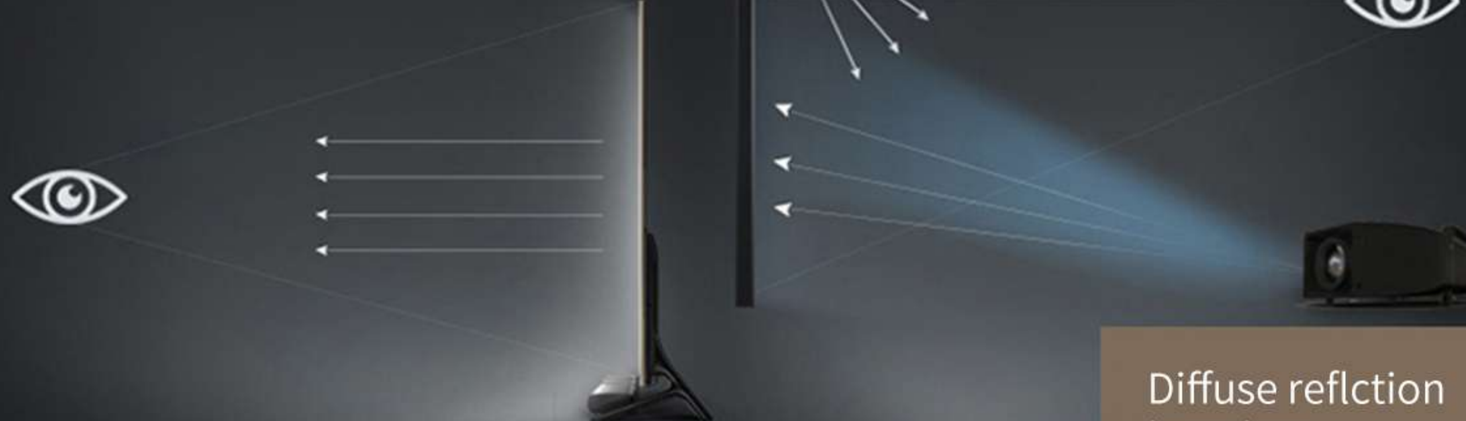
Diffuse reflection imaging

LED screen, Self-luminous direct into eyes