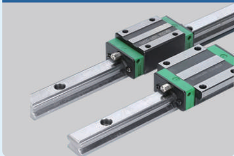
Industrial linear rack