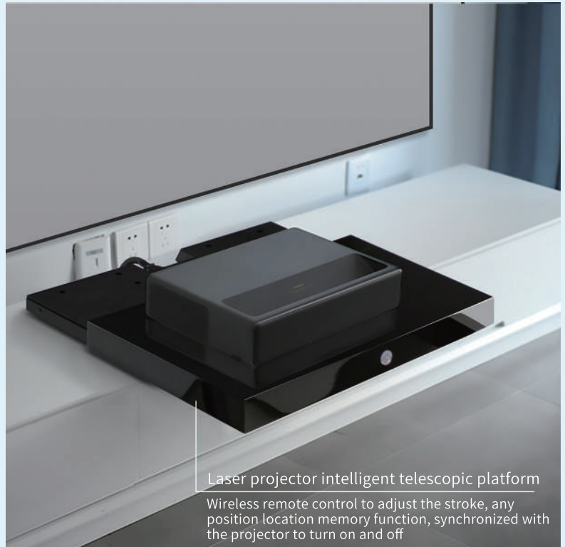
Laser projector intelligent telescopic platform

Wireless remote control to adjust the stroke, any position location memory function, synchronized with the projector to turn on and off