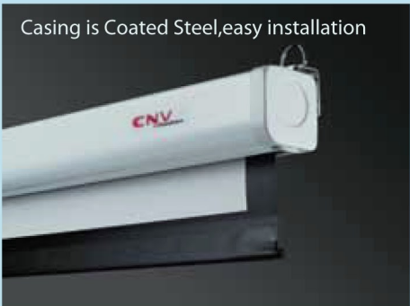
Casing is Coated Steel,easy installation